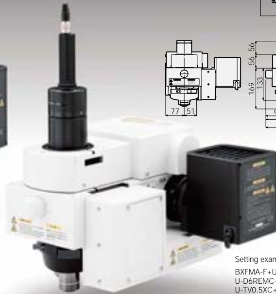
Setting example 2: BXM-A-F+U-AFA1M+U-LH100-3+ U-D6REM+objective lens+U-TLU+ U-TV0.5XC+video camera