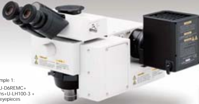
Setting example 1: BXM-A-F+U-D6REM+ objective lens+U-LH100-3 + U-TR30-2+eyepieces